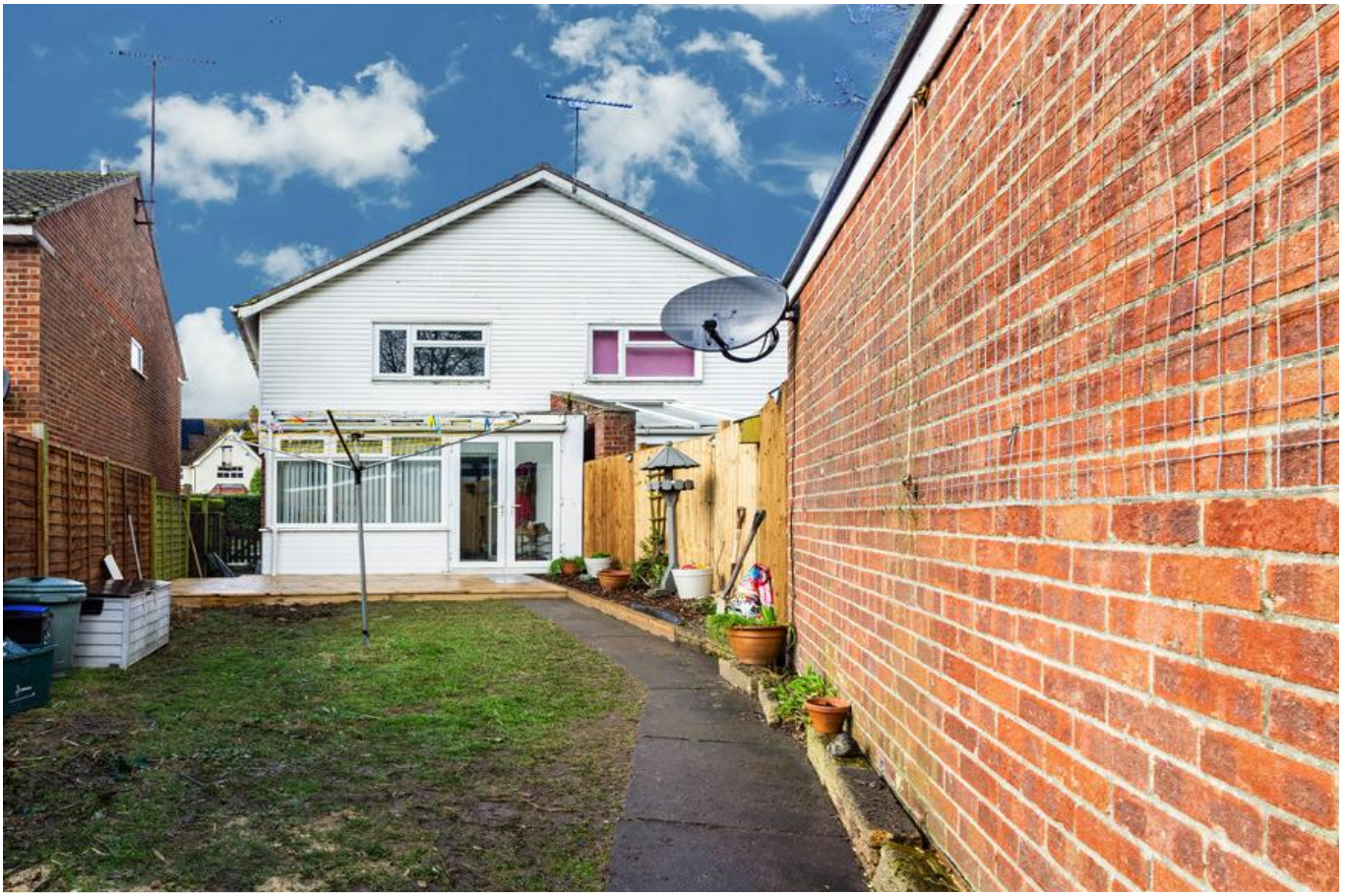
Sage Walk, Tiptree CO5 0AR