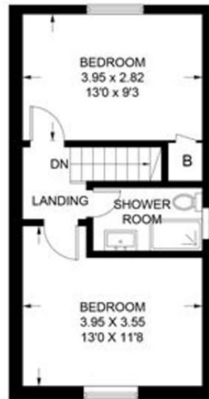
First Floor 32.6 sq m / 351 sq ft

Illustration for identification purposes only, measurements are approximate, not to scale.