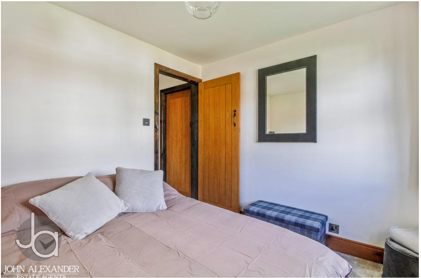
Eleanor Close, Tiptree CO5 0DP