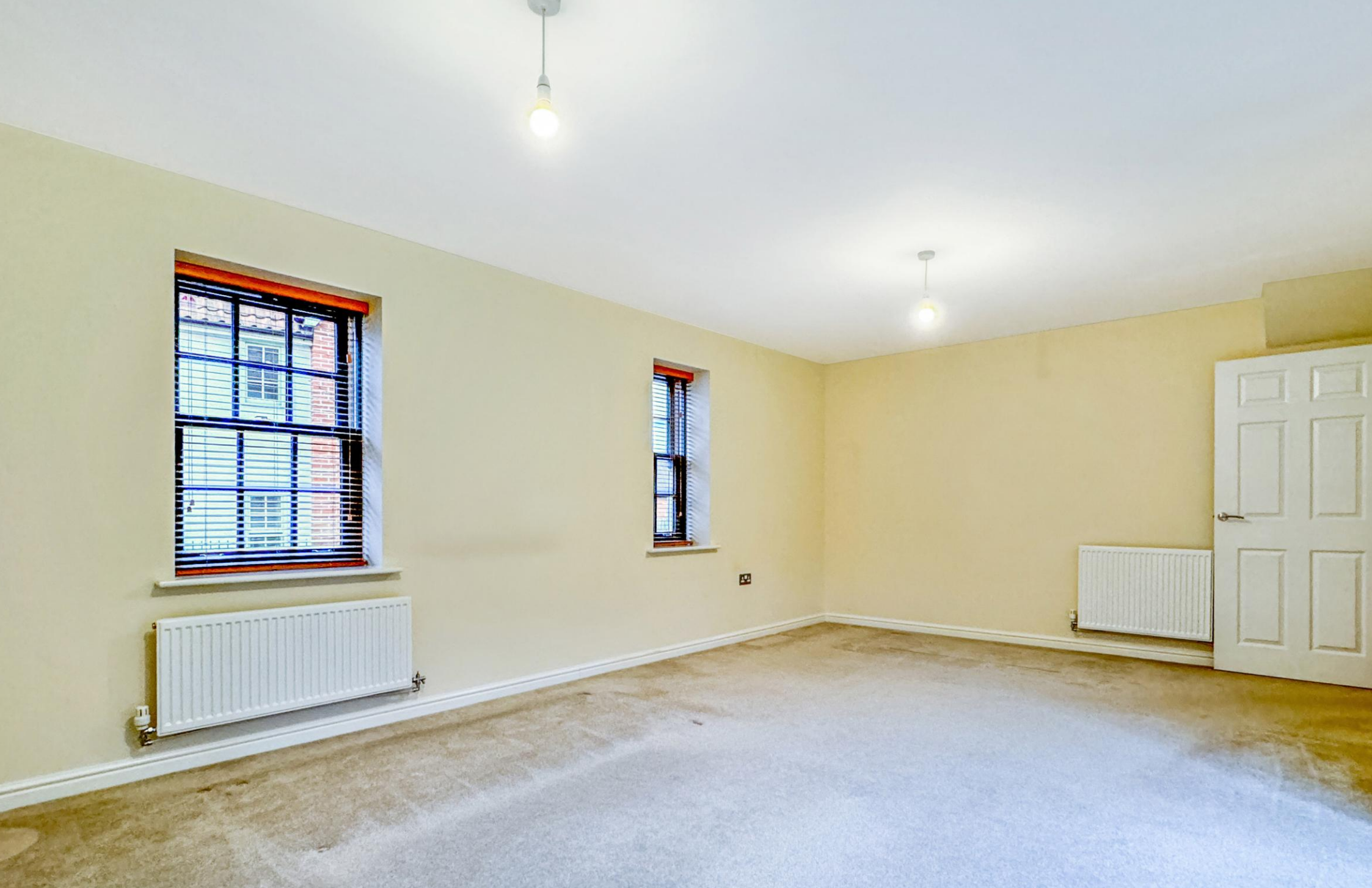
Pikes Marsh, Bures, CO8