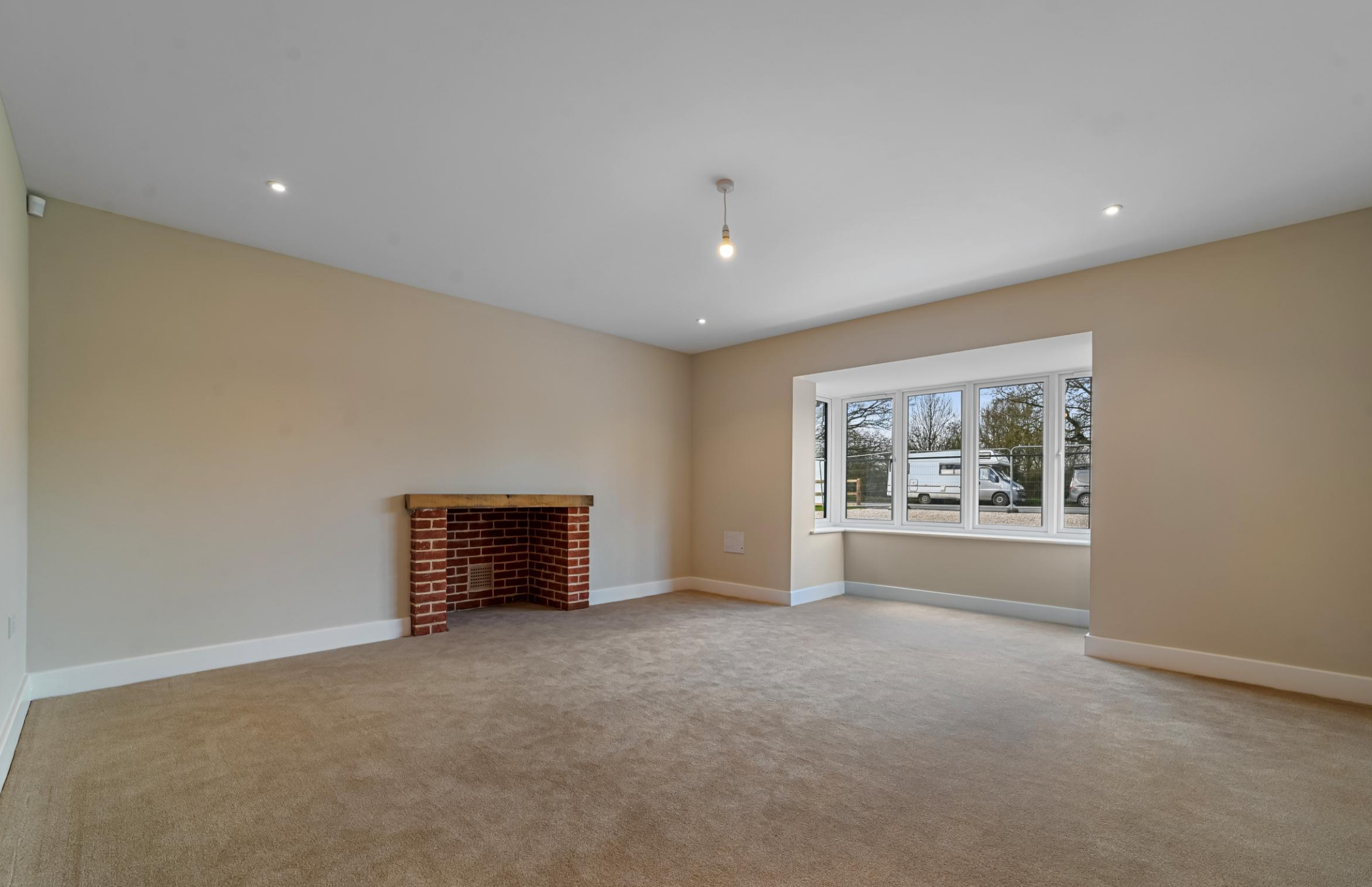
The Paddocks, Turnpike Close, Ardleigh, Colchester, CO7 7QW