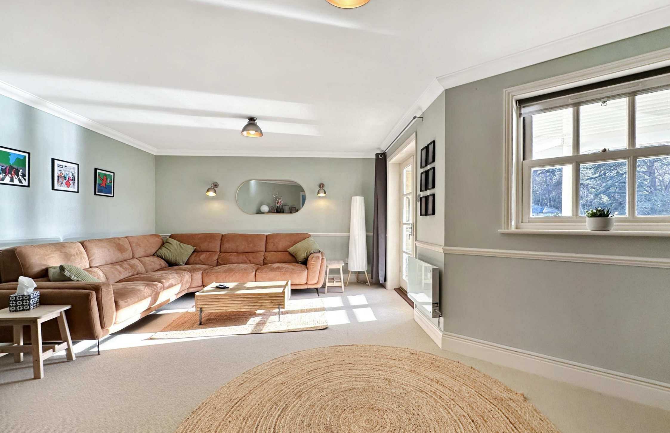
Gilberd House,, Lexden Park, Colchester, CO3 3UF