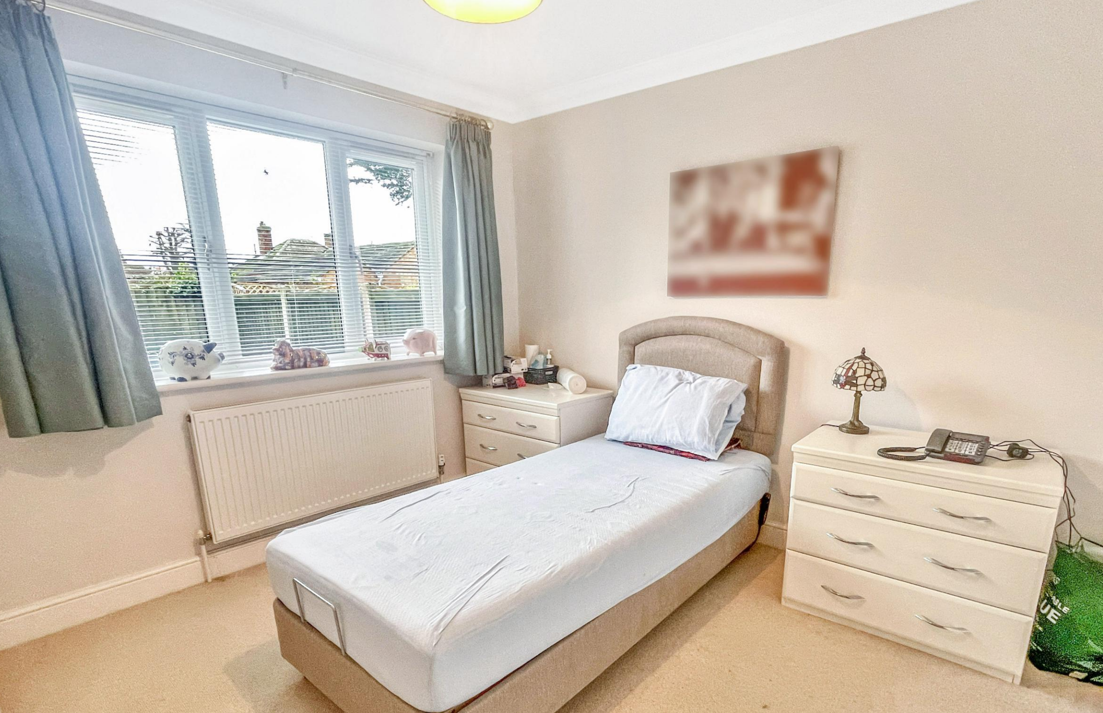
Church Road, Tiptree, Colchester, CO5 0SU