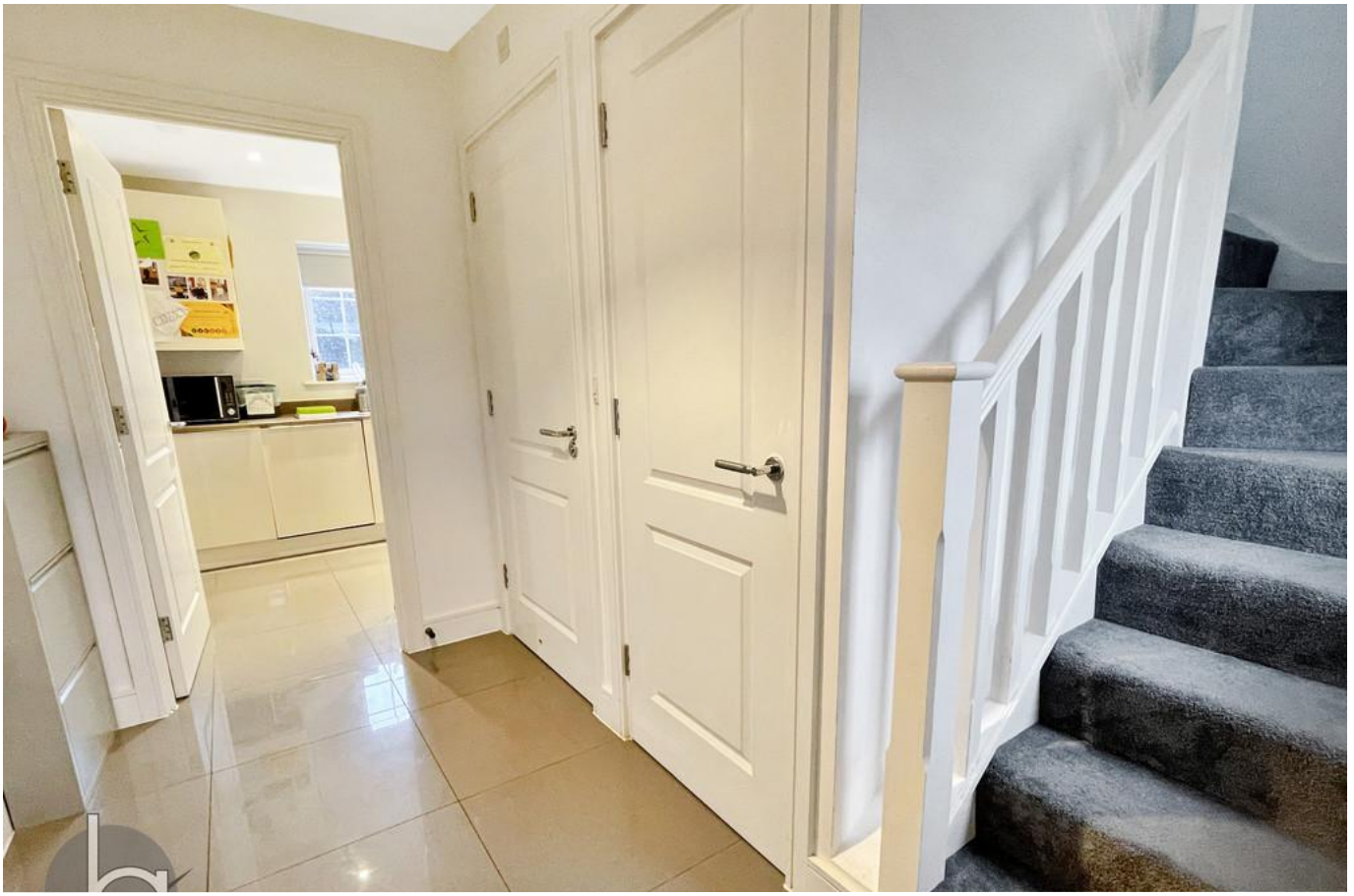
Berryfield Close, Tiptree CO5 0FQ